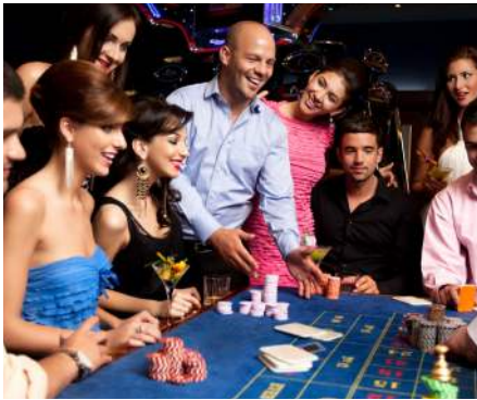
Casino Nights Cut a dash in Las Vegas. A night of thrills and fun awaits, if you play your cards right.