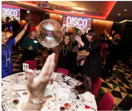
Disco Bingo The Disco Bingo event is an exciting twist on bingo. The standard bingo format has been replaced by much-loved music clips.