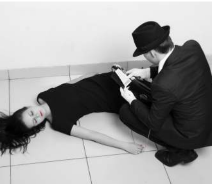
Murder Mystery An exciting event to promote team bonding in a night of motive, mystery, intrigue and murder.