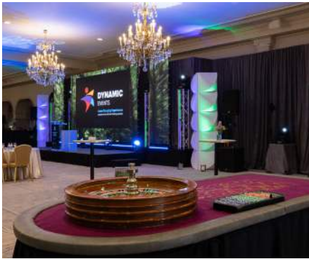
Casino Nights Cut a dash in Las Vegas. A night of thrills and fun awaits, if you play your cards right.