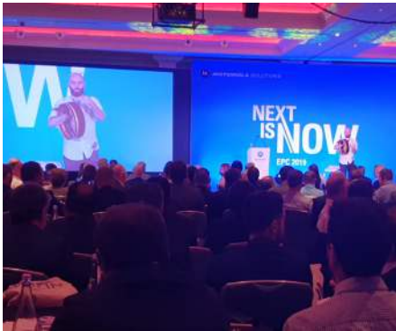
Bodhrán Ensemble This insight into the rich Irish culture is led by a leading international Bodhrán player.