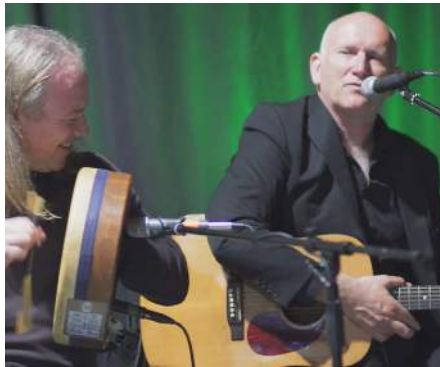
Celtic Live A traditional lively Irish entertainment evening provided by a group of Irelands top musicians, story tellers and dancers with an array of Irish instruments and song.